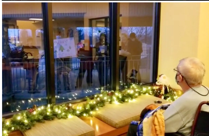
Top: ASME prepares family activity bags for the Food Truck. Children who also received filled stockings. Cathy R made fleece hats and Lynette made hacky sacks and knitted scarves. Bottom: ASME loves on shut-ins — caroling through closed windows to wish a merry Christmas.

ROOM FOR RENT — Available for a female roommate. Bedroom, garage, access to entire home; utilities and laundry facilities included. Background check is required. Call Teri Tipton for details ( 616-402-2190 ).